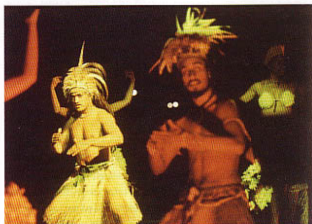
TOP: Tiaporo, the devil-son refuses to recycle whereas Tao sorts his garbage, Tahiti. ABOVE: 'Kari Kari', traditional dance from Rapa Nui.