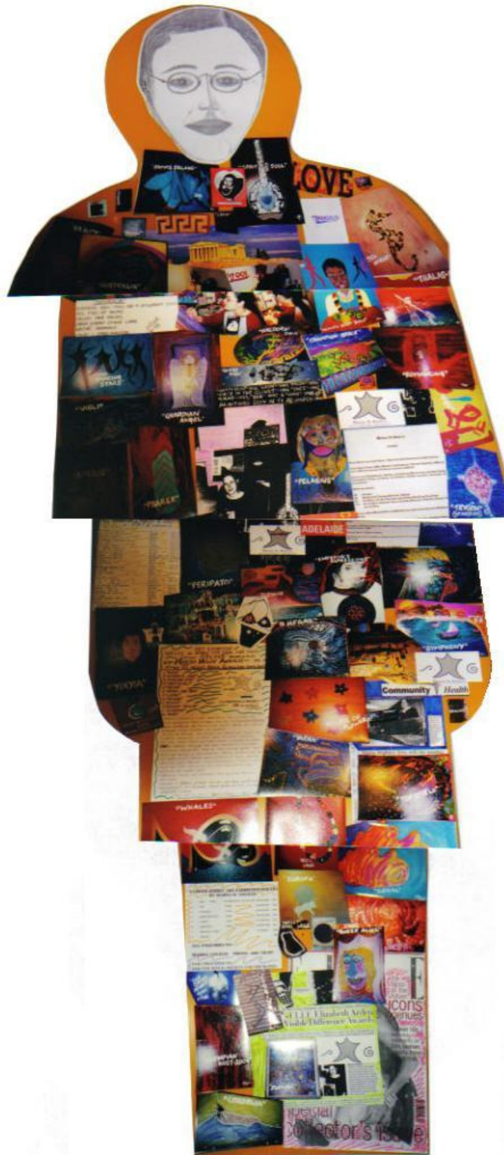
PEOPLESCAPE FIGURE OF MARISA ANGELIS 2001